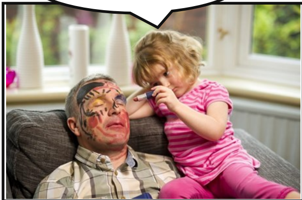
Budding artist at work.